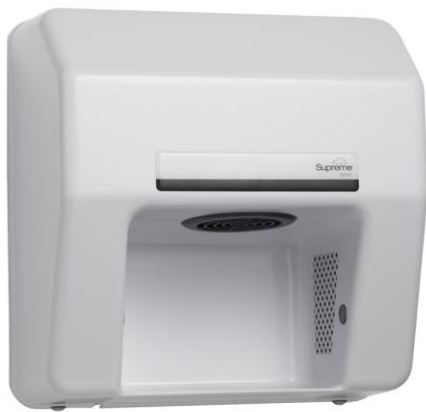
BA101 - White

The Supreme BA101 hand dryer is a heavy duty and economical model. With over 20 years proven reliability in New Zealand environments, the machine’s unique drying chamber and air recirculating feature reduce drying time. Suitable for installation over bench tops or reflective surfaces.